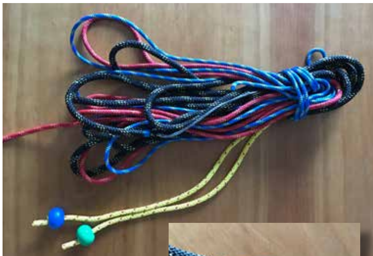
Backtail Line for J80

Based on the blueprint of your gennaker, telling where in your gennaker the patches are mounted, we will tailor the Backtail Line for your gennaker.